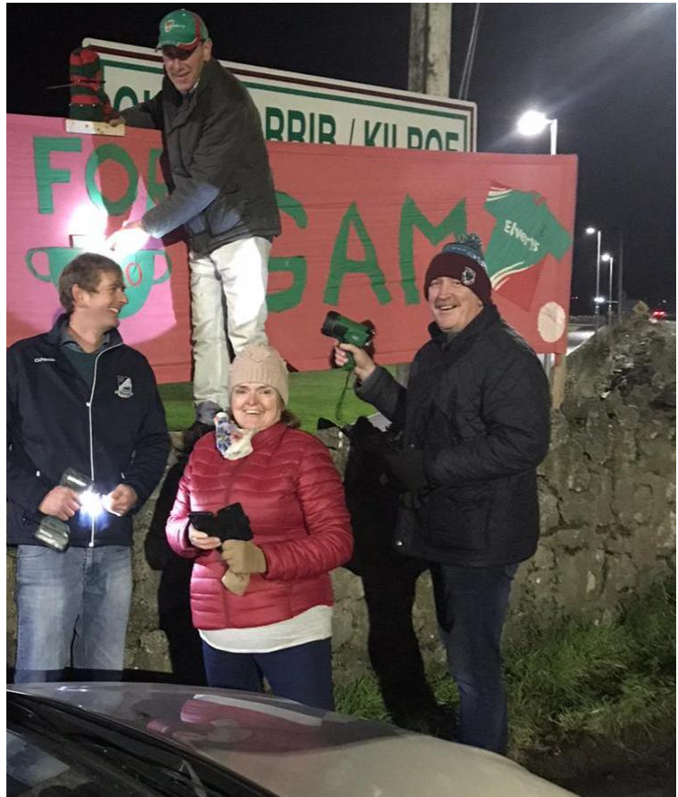
AS GLENCORRIB GETS READY FOR THE FINAL